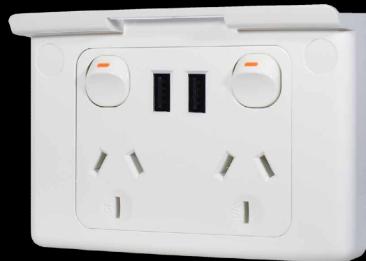
COSHELF (in use with COPP2USB2G)