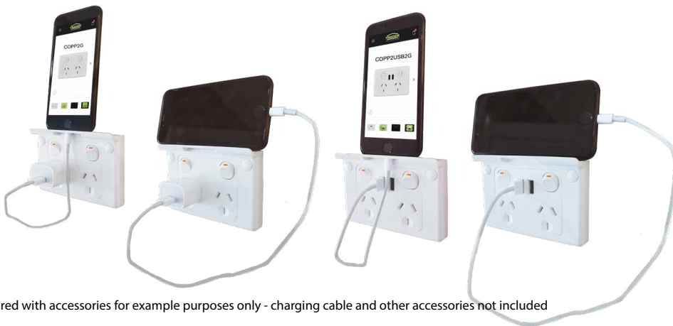
Pictured with accessories for example purposes only - charging cable and other accessories not included