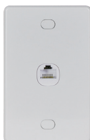
Example of cover plate with MERJ6CM data mech installed