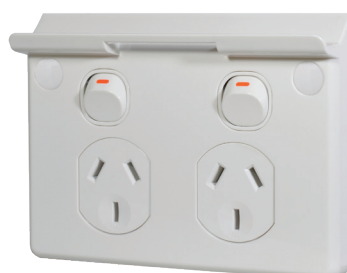
Example of the shelf in use with PUPP2G