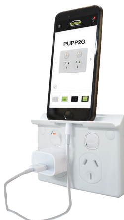
Example of the PUPPSHELF in use