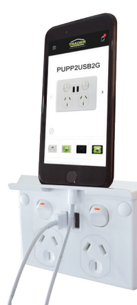
Example of the PUPPUSBSHELF in use