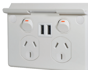
Example of the shelf in use with PUPP2USB2G