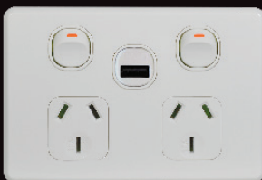
MEUSB with Flat Cat