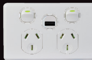
MEUSB with Cheetah