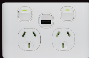
MEUSB with Leopard