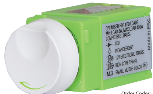
Order Codes: DIMR