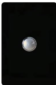
DIMPRKBS on a black switch plate (example)

TRADER 100 Years of Gerard Electrical Tradition