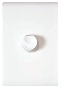
DIMPR knob on a white switch plate (example)