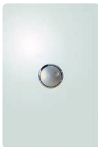
DIMPRKBS on glass-look switch plate (example)