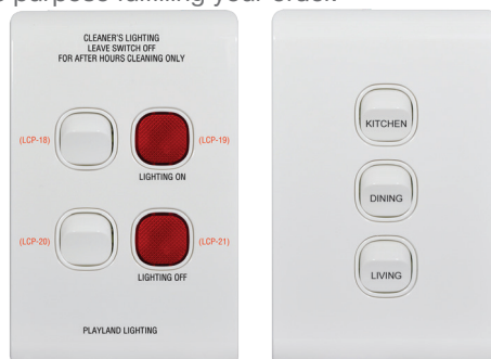
Examples of printing on plates and mechs.