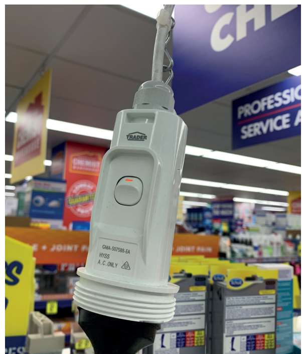
Hyena suspension sockets provide versatility and functionality.