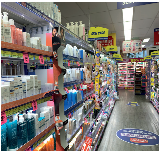
The main housing contains a solid loop for chain or wire rope connection, to provide support and strain relief for electrical cabling.