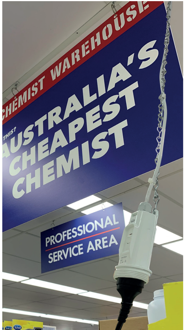
Providing overhead power in convenient places above the aisle, (benches or work areas) where other fixed sockets cannot be located.