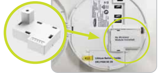
Easy to insert wireless module

Easy pairing: Press TEST on Master (3 times in 2 sec) and linked alarms to pair. See instructions for more detail.