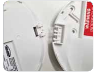
Hinged base plate easily detaches

Base plate comes with 4 large terminals with ample wiring room.