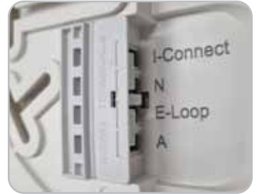
Clearly labelled easy to identify sensor wiring