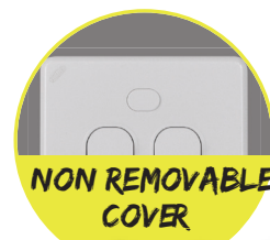
NON REMOVABLE COVER