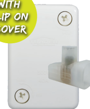
HYJB4TFC 68mm (w) x 99.5mm (h) x 47.5mm (d)