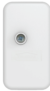
HYJB43T 41mm (w) x 73mm (h) x 26mm (d)