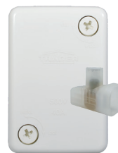
HYJB4TF 68mm (w) x 99.5mm (h) x 47.5mm (d)