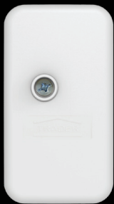
HYJB43T / HYJB3TE