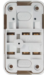
HYJB43T (Back view)