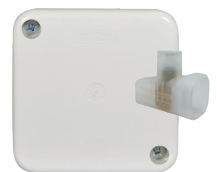
HYJB54T 70mm (w) x 70mm (h) x 35.5mm (d)