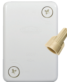
HYJB4TFT 68mm (w) x 99.5mm (h) x 47.5mm (d)