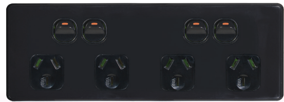
Order code: FLPP4GBK