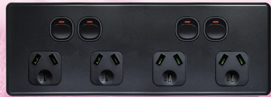
Order code: FLPP4GMBK