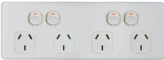
Order code: FLPP4G

Available in Black, Matt White and Matt Black.