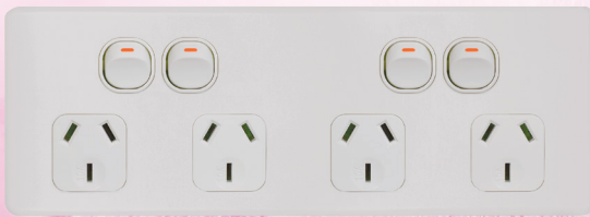
Order code: FLPP4GMW